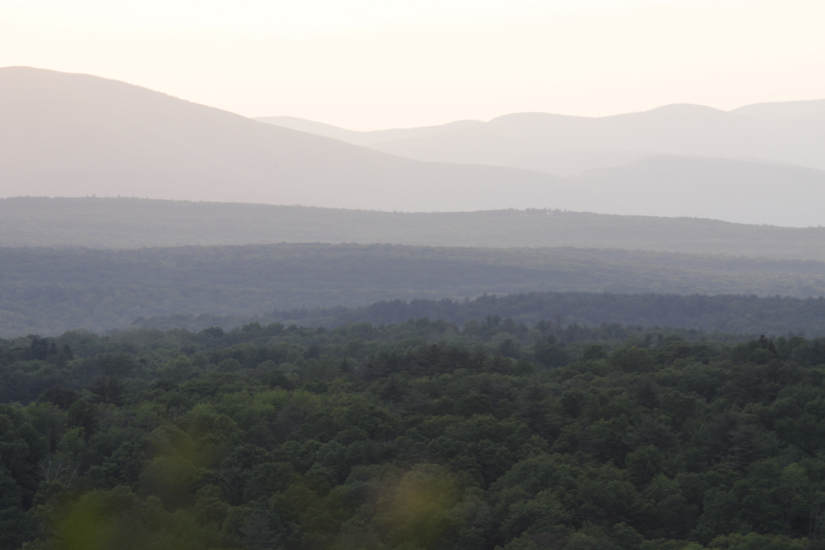
The Catskills as seen from the mountain where the Chironian is located directly below, facing westerly. Photo by Eric Francis, c. 2004.