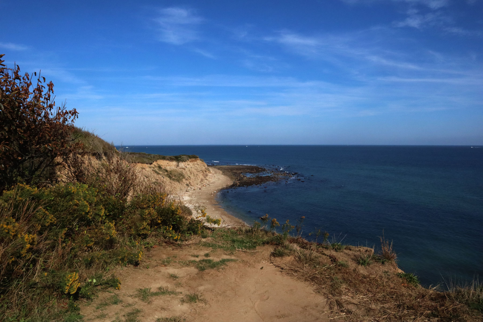
Atlantic Ocean from Camp Hero, Montauk.