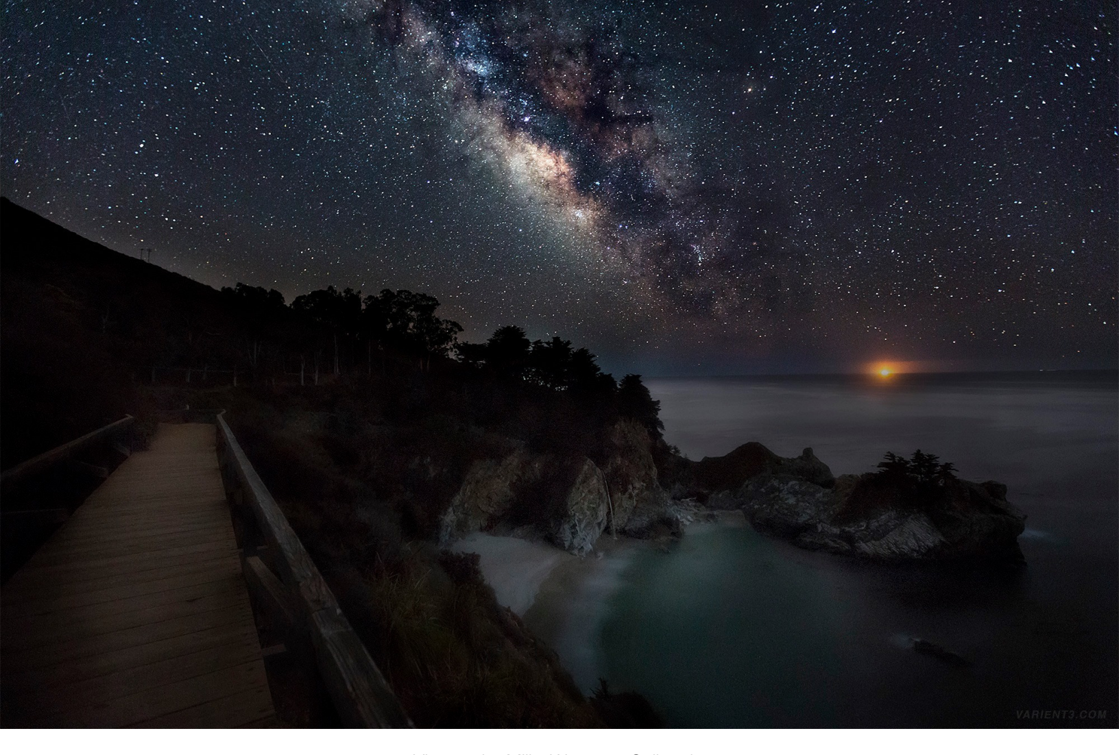
View of the Milky Way from California.