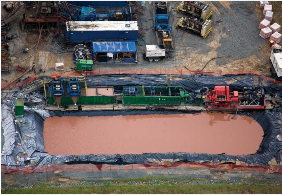
Waste pond at hydro-fracking drill site, Dimock, PA