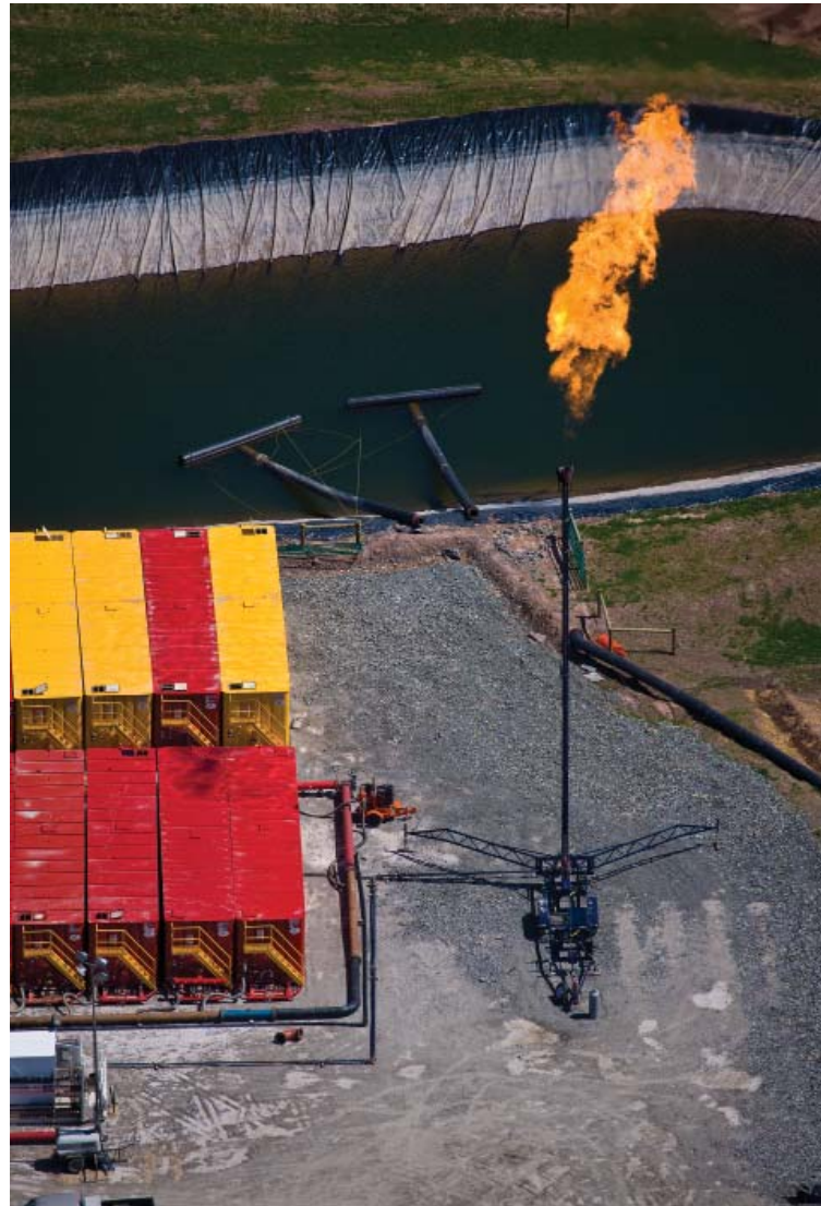
Flare at hydro-fracking gas drilling operations near Sopertown, Columbia Township, PA

A lender's title policy insures the mortgage lien, as of the date of the policy (up to the loan amount), against loss or damage if title is vested in someone other than the homeowner. Gas leases signed after the policy date are not covered by the policy. Gas leases in effect when the policy is issued will be listed as a title exception. Coverage won't include the gas lease or any claims arising out of it. Title endorsements don't eliminate this exception to coverage. Underwriters consider these exceptions a red flag, sufficient to jeopardize the loan. Lenders financing properties subject to compulsory integration won't discover the title encumbrance from a title search because ECL § 23-0901 makes no apparent reference to recording the DEC determination of compulsory integration in the land records. New York title policies expressly exclude from coverage loss or claims relating to any permit regulating land use. It remains unclear