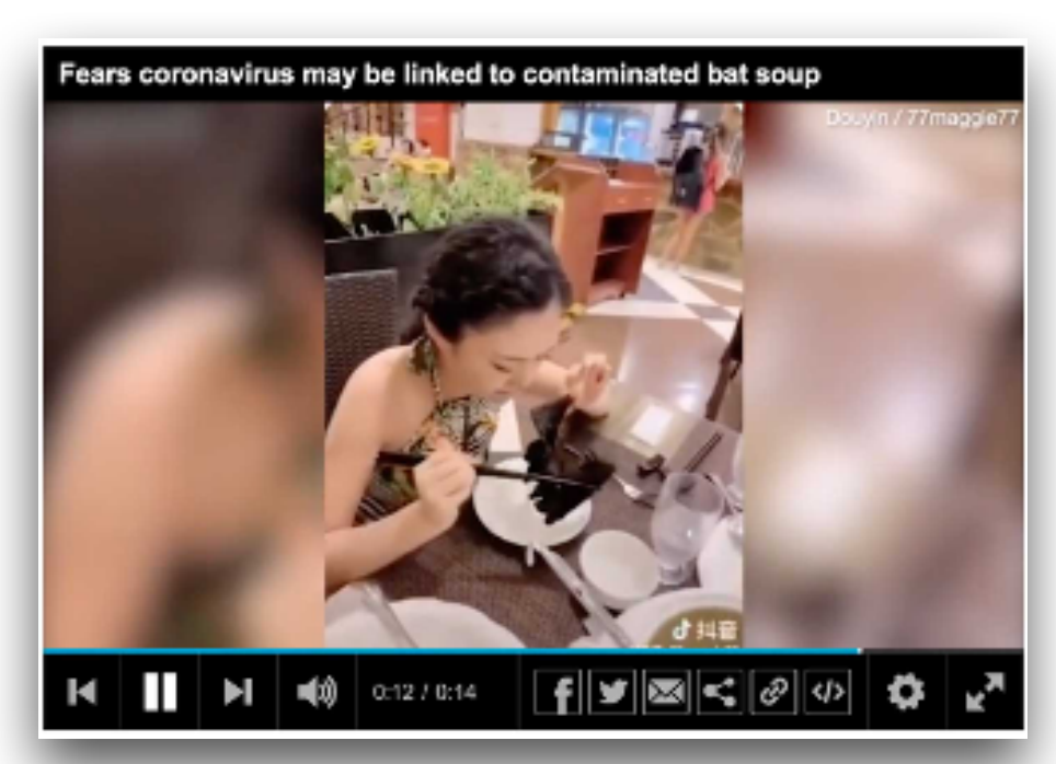
The infamous Bat Soup video distributed in late January was made in Micronesia in 2017, not China in 2020.

The video and photos immediately "go viral" and are shared around the world. In fact, the video was shot in 2017, and it was not in China but rather