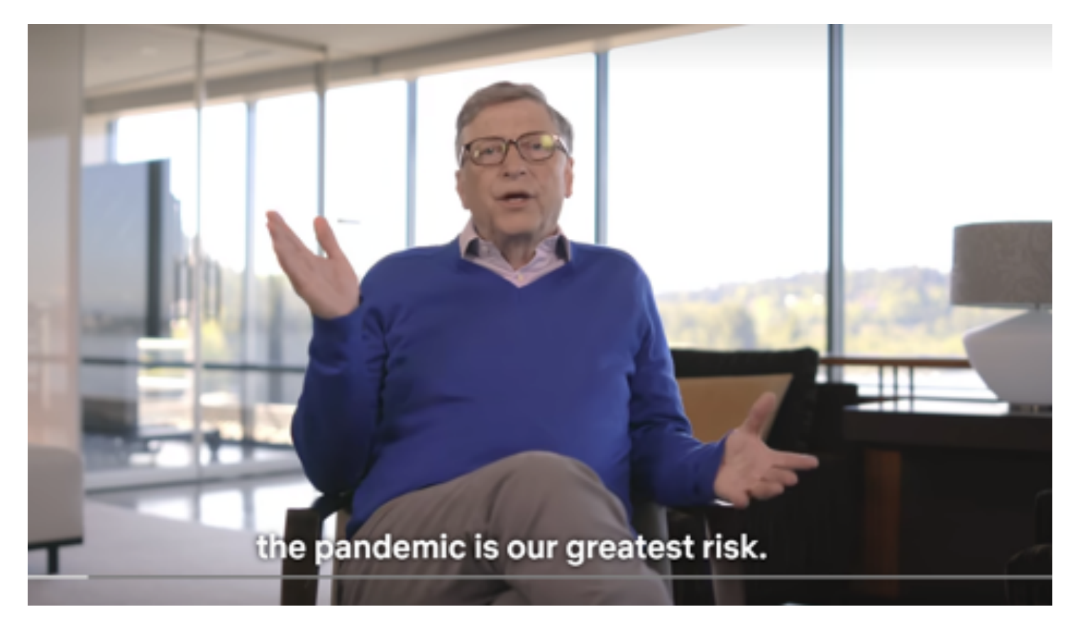
In November 2019, <u>The Next Pandemic</u> premiered on Netflix, featuring Bill Gates. That was three weeks ahead of a claimed global outbreak. Was this a coincidence, or preparation? Gates, a vaccine pusher and sponsor of the WHO, becomes one of the great celebrities of the "covid" era.

effort in the face of danger and death; by a deepening capacity for moral discernment born from experience and suffering; and by the transformation and forging of enduring structures, whether material, political or psychological."