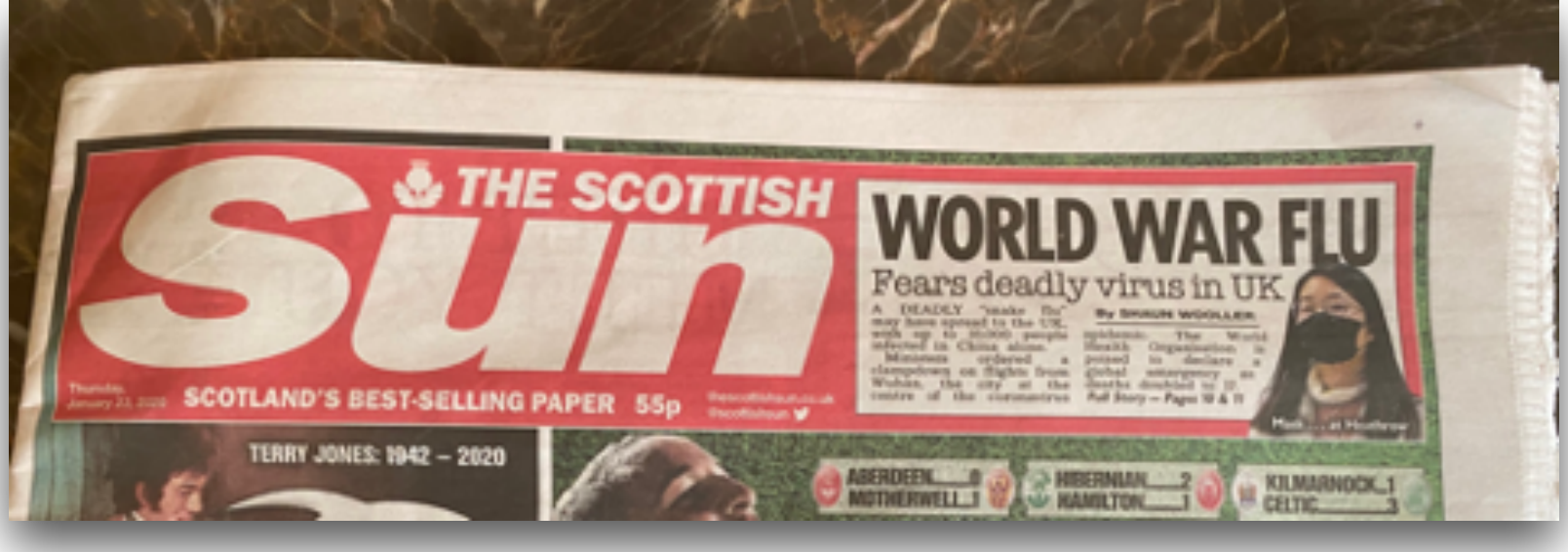
Headline from The Sun on Jan. 21, 2020 declares the start of World War Flu.

On Jan. 22, the city of Wuhan banned the sale and breeding of wild animals. Evidently they were not in a big hurry to do that. Within the city, this has all dragged on for seven weeks before they do.