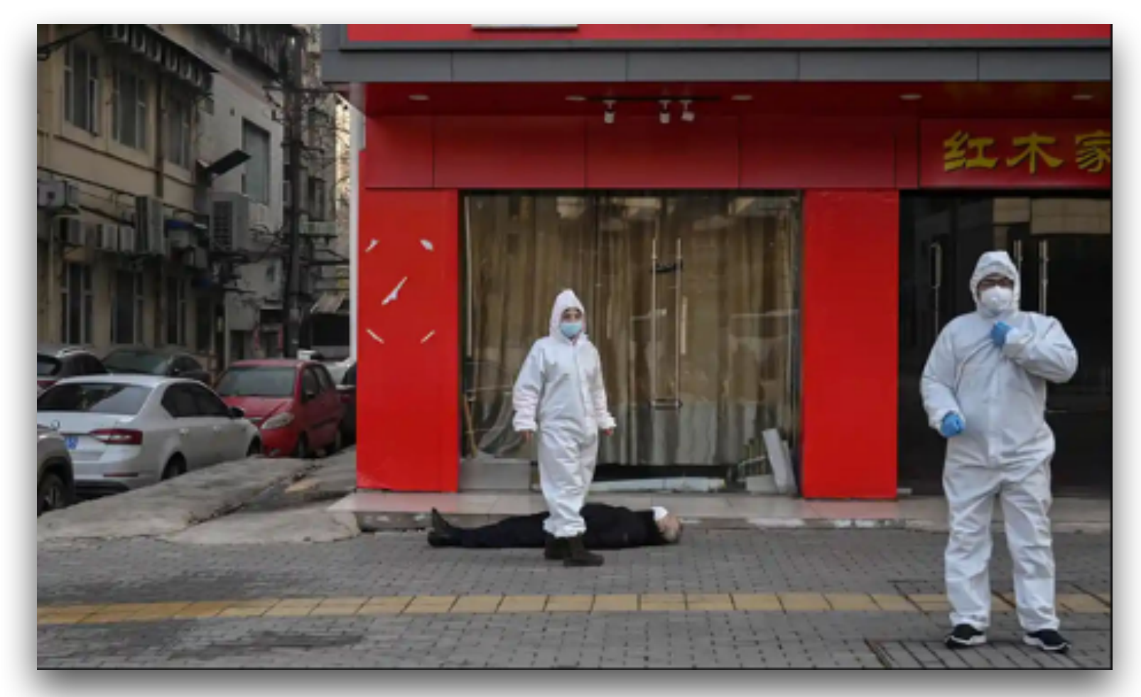
This photo of a man purportedly laying dead on the street of Wuhan, China, was taken January 30, 2020 as the pandemic was being rolled out in the international media. It was published by many newspapers around the world and quickly became one of the most iconic images of the covid era, providing "photographic proof" that there was indeed a plague spreading in Wuhan.