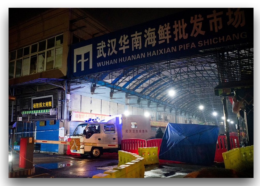
Emergency crews at the Huanan fish market in Wuhan, January 2020. Contact tracing disproved the "wet market theory," as did the entire market testing negative.

With no scientific or medical justification, only on the authority of his credentials, he tells The Sun that the claimed